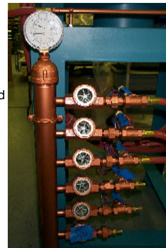
Photograph of closed loop system with common dial flow indicators and flowtek switches.