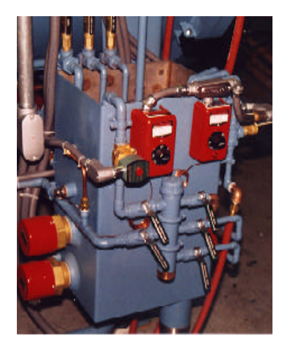
Photograph of open drain system with hot water option.