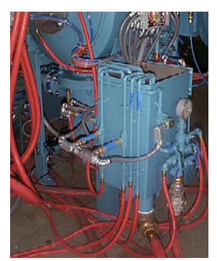
Photograph of open drain water system with drain bosh.