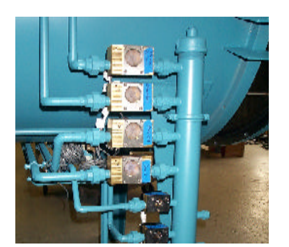
Photograph of closed loop system with Malema flow sensors and integrated flow indicators.